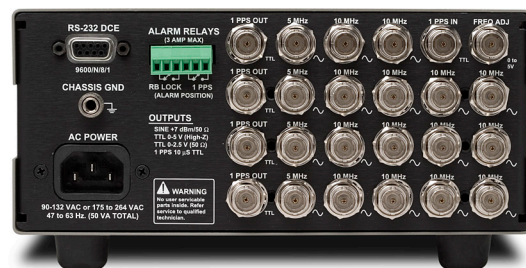
FS725 rear panel (with Opt. 03)