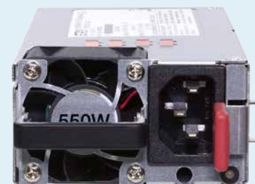
IEC C14 option